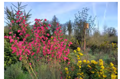
In the spring, native shrubs adorn Ash Creek's riparian area with a beautiful array of colors.

During each bird walk, we were able to tick off a surprising number of bird species for such a small area so close to an urban setting. But perhaps it isn't so surprising when you consider the amazing transformation Ash Creek and its surrounding riparian (streamside) zone have undergone over the past ten years. Invasive blackberry and choking ivy vines have been replaced with a diverse and thriving native plant community, thanks to a restoration effort led by the LWC and supported by many partners - including the cities of Independence and Monmouth, Central School District 13J and ACWCD. In May and June, a profusion of bright yellow Oregon grape blooms and red flowering currant turns this area into a picture-perfect spring landscape. In fact, talented young authors and poets from nearby Central High School (CHS) have used Ash Creek as an inspiration for beautifully written poetry and short stories, published as an anthology entitled " Where the Fish Live and Breathe: An anthology of poetry and short fiction about Ash Creek. "