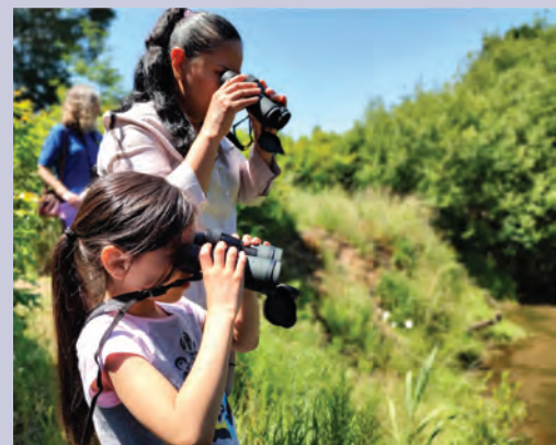
Left: Bird walk participants have fun practicing their binocular skills on a gorrión (sparrow). Right: Watching libélulas (dragonflies) and golondrinas (swallows) fly over Ash Creek was entertaining for all ages!