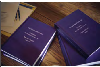
Printed copies of the Kalapuya to English dictionary.

The Kalapuya peoples are the original inhabitants of the Luckiamute watershed and beyond—their ceded lands encompassing nearly all of the Willamette Valley. Today, many Kalapuya are members of the Confederated Tribes of Grand Ronde and the Confederated Tribes of Siletz Indians.