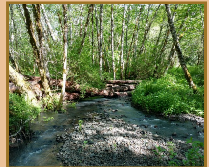
Left: Upper culvert, pre-project, March 2014; Center: Same site, post-project during the project tour, August 2016; Right: Post-project; note gravel bed formation resulting from large wood structures, May 2017.