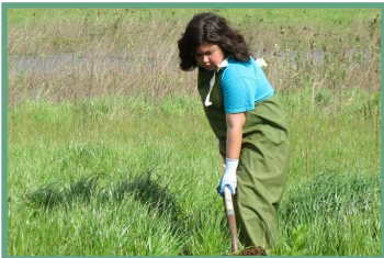
An Earth Day volunteer adds native plants to a wetland area at Luckiamute State Natural Area, April 2017.