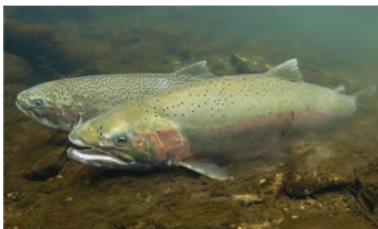
Male and female steelhead trout

In this year's line-up of monthly Behind the Scenes bulletins, you can look forward to reading about the activities of our awesome volunteers, cool projects unfolding in the watershed, upcoming Love Your Watershed events, and maybe we'll even be able to share a few awesome beaver sightings and stories from around the watershed! We want to keep you in the loop, show you where your support makes a splash, and invite you to join us for engaging events and meaningful activities. Sure, there will be challenges ahead. But with your partnership, we'll tackle them head-on, celebrating victories big and small along the way. Let's make 2024 a year where our community overflows with support of - and love for - the beautiful rivers and landscapes of the watershed.