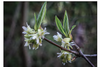
Osoberry ( Oemleria cerasiformis ) flowers can appear as early as January.

This year, let's roll up our sleeves together. We'll continue to focus on planting lots of native trees and shrubs across our project areas, protecting and restoring the health of our streams and rivers, and building a more connected community where everyone has the opportunity to show how much they love their watershed. As a part of the Friends of the LWC network, you play an outsized role in keeping the momentum going. If you've already made an end of year donation or pledged to volunteer, thank you so much for renewing as a Friend for this year! And if you haven't yet done so and would like to now, please visit www.LuckiamuteLWC.org/friends.html#renew and scroll down to see which of the THREE ways to renew your membership works best for you.