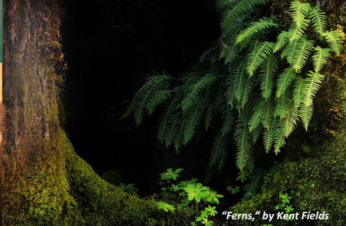
"Ferns," by Kent Fields