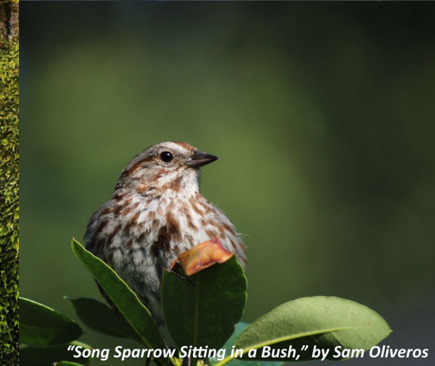
"Song Sparrow Sitting in a Bush," by Sam Oliveros