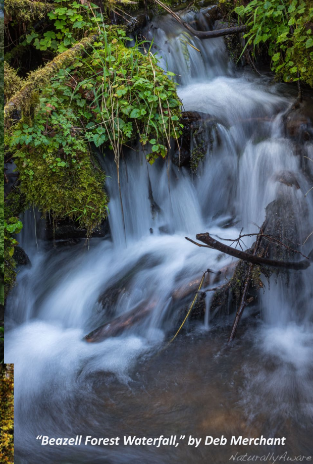
"Beazell Forest Waterfall,"